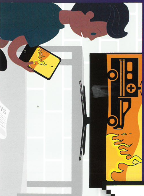
Seeing scary stuff in the news