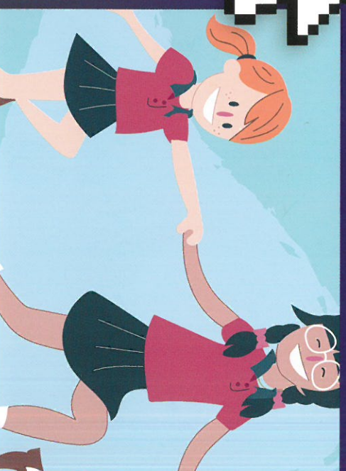
Wanting to fit in