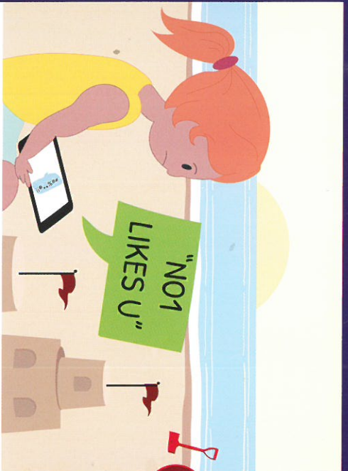
Cyberbullying & social media