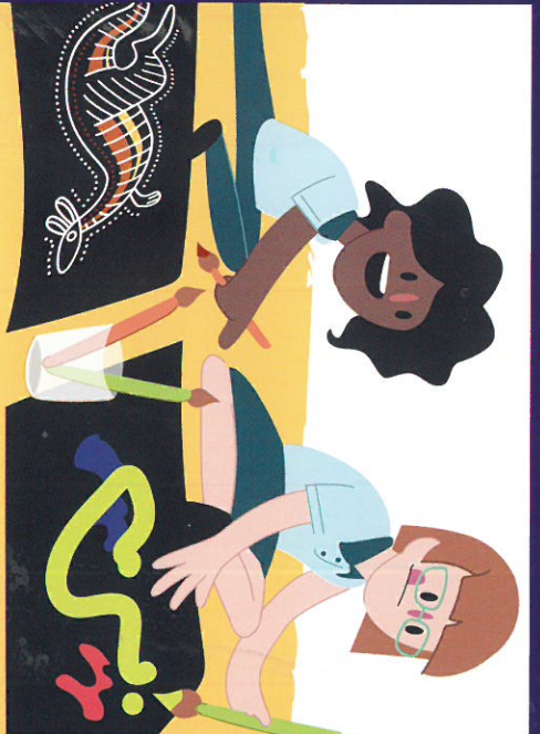
It's OK to be yourself