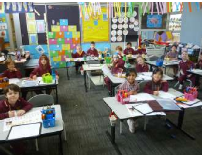
Smile while you work Foundation R