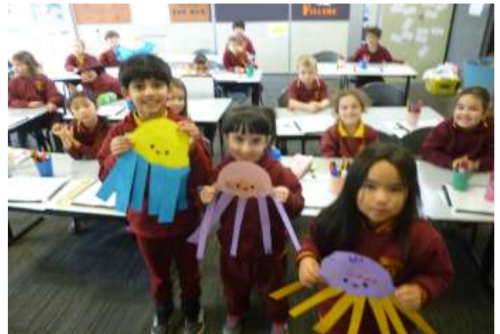
Proud jellyfish owners in Foundation C