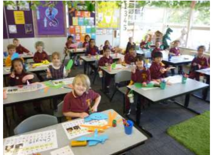
J is for jellyfish, so say Foundation S!